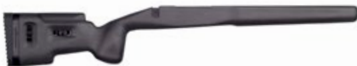
AEROGRADE LONG RANGE ADJUSTABLE TACTICAL STOCK