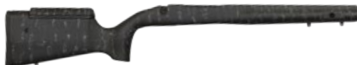
CARBON FIBER COMPOSITE LONG RANGE HUNTER STOCK