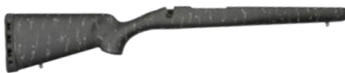
CARBON FIBER COMPOSITE SPORTER STOCK

The same great components used to make the Christensen Arms firearms are available separately as components and accessories.