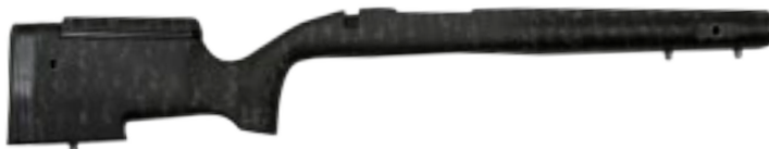
CARBON FIBER COMPOSITE LONG RANGE TACTICAL STOCK