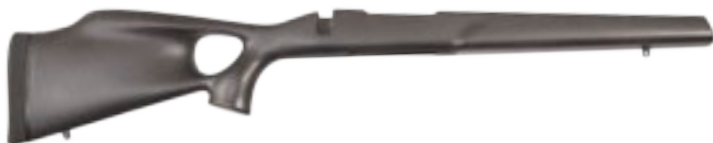
AEROGRADE CARBON FIBER THUMBHOLE STOCK