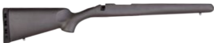
AEROGRADE CARBON FIBER SPORTER STOCK