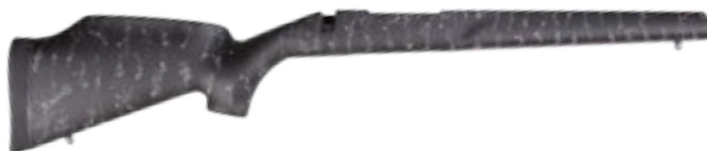
CARBON FIBER COMPOSITE MONTE-CARLO STYLE STOCK