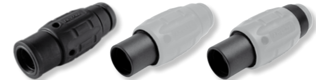
Fig. 1 Aimpoint 3XMag with rubber

In order to use the 30 mm diameter tube(s), the rubber covering that surface must first be removed. Remove rubber from the front tube as shown in fig. 2 below when TwistMount or one ring is used (most common). Remove rubber from both tubes as shown in fig. 3 when both tubes are used. Use a sharp knife and carefully cut through the rubber along the circumferential groove making sure not to cut into the metal body.